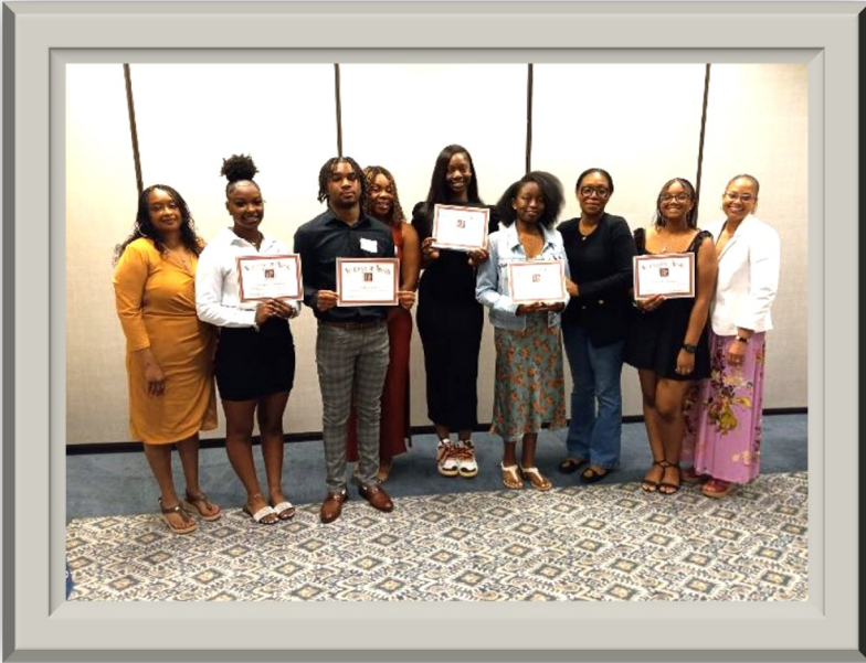
This year's Scholarship and Community Service Recipients